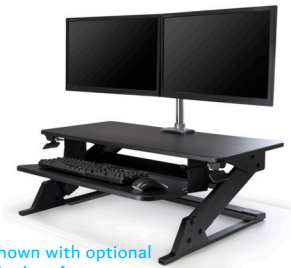
Shown with optional Monitor Arm